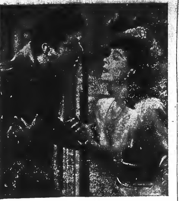
QUARREL... John Carroll and Ruth Hussey indulge in a lovers dispute in an hilarious scene from M-G-M's "Pierre of the Plains," at the Liberty Theatre Monday and Tuesday.