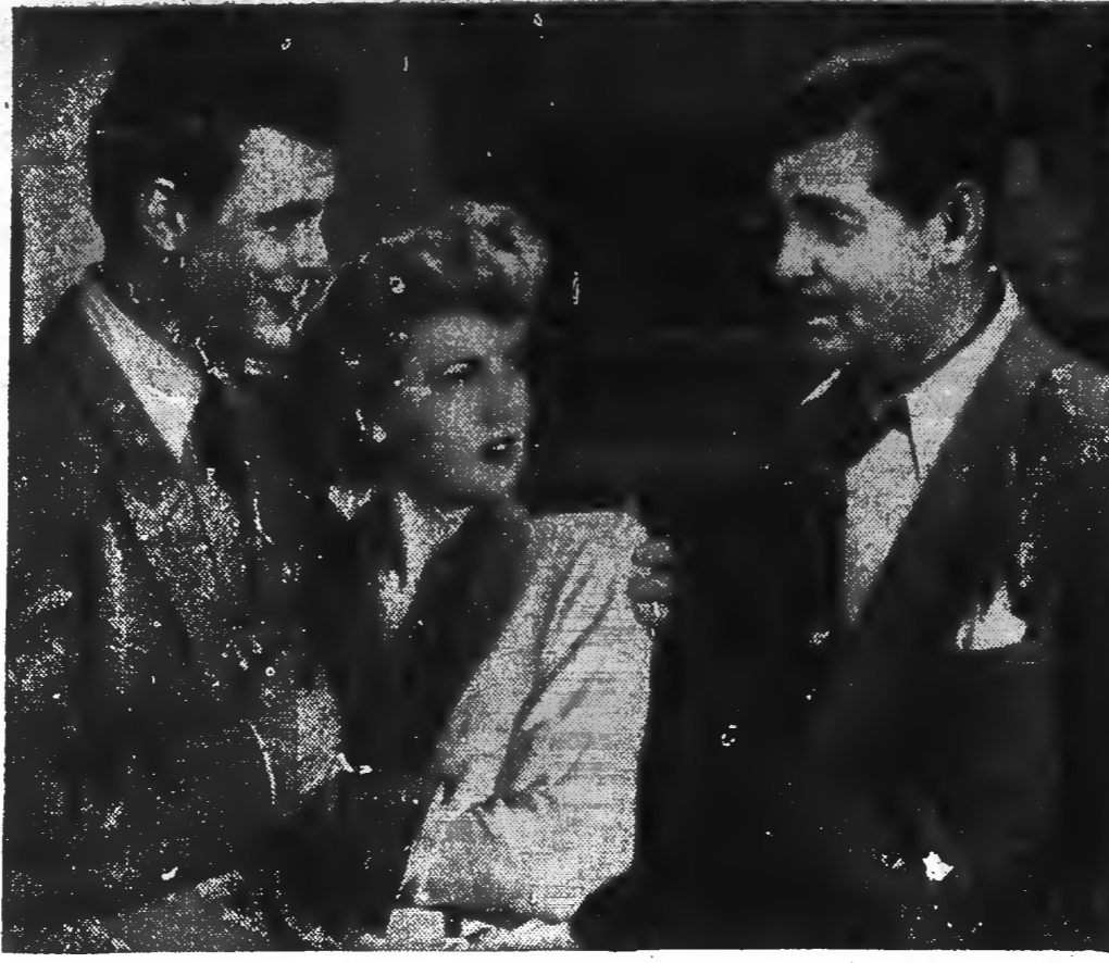
A tense moment occurs in M-G-M's "Somewhere I'll Find You," at the Liberty Thursday-Friday when Robert Sterling, who plays Clark Gable's brother in the picture, announces his engagement to Lana Turner, with whom Gable is also in love. This exciting film of war correspondents in the Pacific war area was directed by Wesley Ruggles.