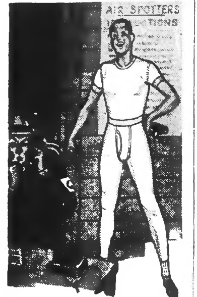
"Boy, it's cold at this air-raid post"

THE NEW... HANES UNDERWEAR Now In Stock! Harris Bros. DEPARTMENT STORE