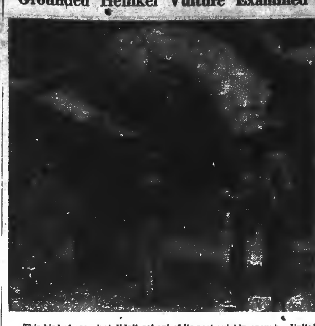
This bird of prey just didn't get out of its nest quickly enough. United States army officers are shown inspecting an intact Heinkel HM3 ; which was captured when the Allied forces took an African airport. cting an intact Heinkel HM3 plane