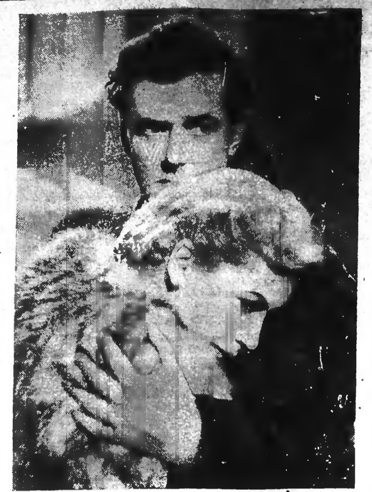
HOSTAGES —Sentenced to die by the Nazi invaders of Norway, Hugh Williams and Deborah Kerr are together in one of the most dramatic sequences of Paul Soskin's exciting picture, "The Avengers," the Paramount film now at the Liberty Theatre.