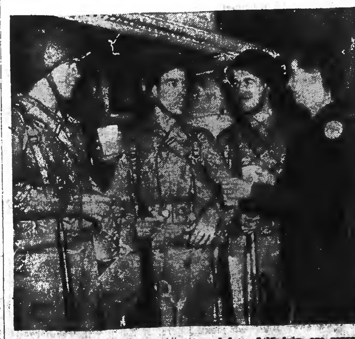
Three Yankee toughboys, just returned from field duty, are served coffee and doughnuts by Mrs. Theodore Roosevelt, wife of Brig. Gen. Theodore Roosevelt, in the American Red Cross club in London. She is a daughter-in-law of former President Theodore Roosevelt. Neighbors say the boys polished the bandoff.