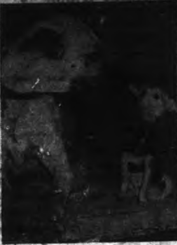
A study in canine contrasts at the opening of the Westminster Kennel club show in New York. The big dog is a Great Dane, Dine Xanthippi. The half pint is Thein's Little Man II, a Chihuahua, and weighs only about a pound.

Two million pairs of farmers' shoes are to be made from 1,000,000 cowhides in Bulgaria.