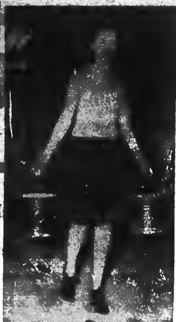
Ray Harden of New York carries a pail of water in each hand as she demonstrates the proper way to walk to equalize pressure on both shoes so that they'll both wear at an even rate. The chart she is walking upon is supposed to measure the proper length of stride. Shoes cannot be cross-switched like tires, so equalization of wear is important.

It takes healthy, straight bodied, full topped trees to produce good timber rapidly; so that is the type of tree that is most profitable to be left standing. There is no doubt that forest lands like agriculture lands will respond to proper methods of management with increased production.