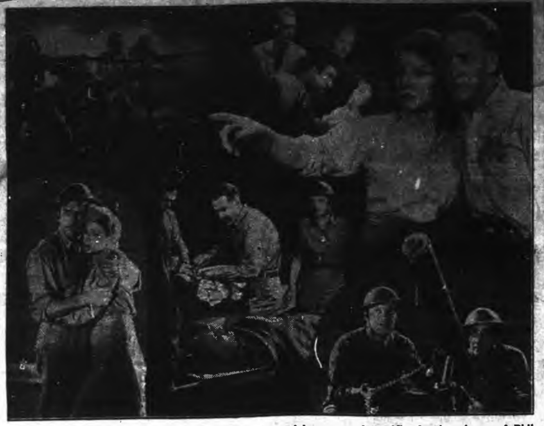
At last the epic drama of those twenty-eight days of heroism and sacrifice by American and Philippine forces at Corregidor comes to the screen. It represents one of the greatest battles in modern history, and the events have been carefully recorded in strict accordance with the actual happenings on "The Rock". It comes to the Liberty Theatre on Monday and Tuesday.