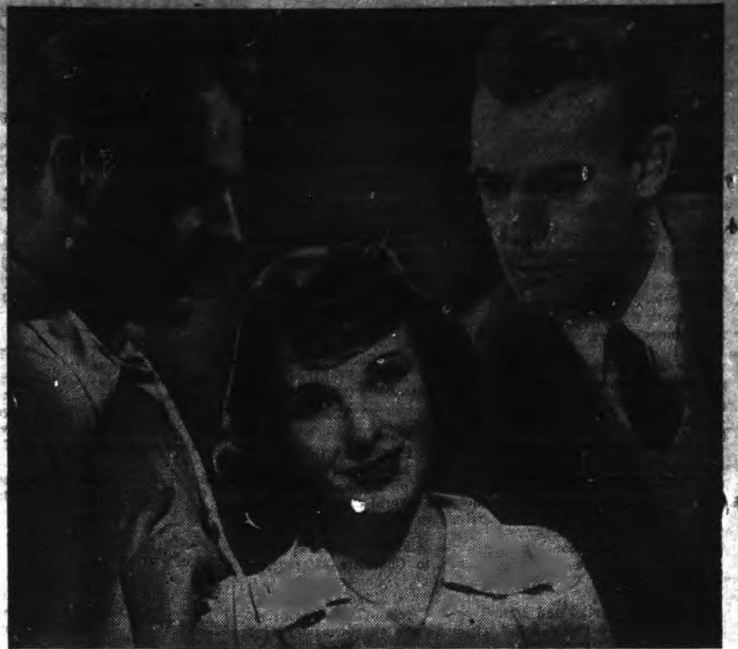
Having two men on her hands invites unusual adventures and plenty of trouble for heroine Ann Lee, who becomes involved with Brian Donlevy and Dennis O'Keefe, in the startling, suspense-filled melodrama, Arnold Pressburger's "Hangmen Also Die" which is scheduled to bow in at the Liberty Theatre on Monday and Tuesday.