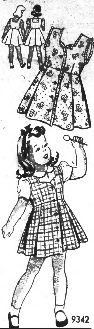
Pattern 9342 may be ordered only in children's sizes 2, 4, 6, 8, 10. Size 6, jumper, requires 1 1/2 yards 35-inch; blouse, 3/4 yard contrast.

Send SIXTEEN CENTS in coins for this Marian Martin pattern. Write plainly SIZE, NAME, ADDRESS, STYLE NUMBER. Ready now—our new Summer 1943 Pattern Book! Just TEN CENTS more brings you this practical sewing guide for the entire family.