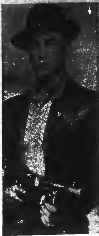
Alan Ladd takes his quick trigger finger far away from his usual gangland haunts to Paramount's "China", the powerful picture now at the Liberty Theatre with Ladd, Loretta Young and William Bendix as the stars. It's one of the most exciting war films yet to come out of Hollywood.