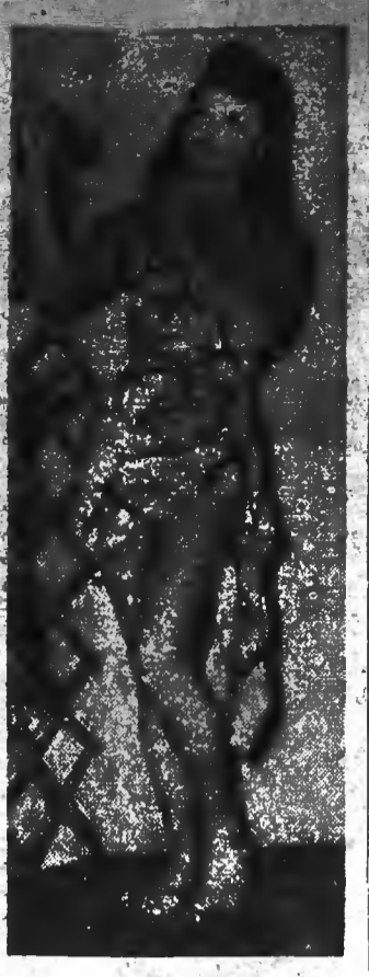
SIMONE SIMON Currently appearing in "Tahiti Honey", Republic's new musical.