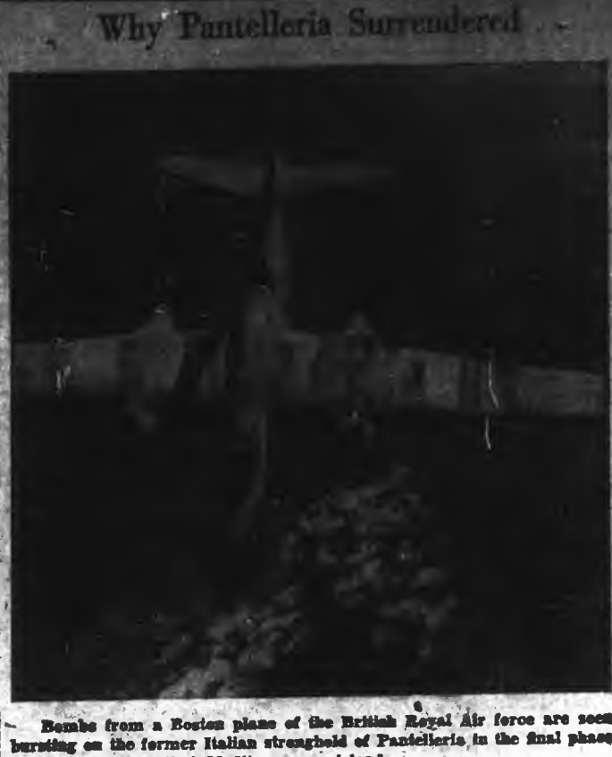
Bombs from a Boston plane of the British Royal Air force are seen burning on the former Italian stronghold of Pantelleria, in the final phase of the battle for that Mediterranean island.

General announcement has been made by O. P. A. that stoves, ranges and heaters will be rationed after August 23, and this is the last week in which to buy them without a certificate. Rhodes-Day Furniture Co., of this city, is offering a very complete showing of stoves, ranges and heaters, and the public is reminded that this is the last week in which they may be purchased without submitting application to ration boards. Although the company's display shows several sizes and styles, the number of each is limited, therefore early buyers will get choice in meeting their needs. See the firm's ad. in this issue for more complete details.