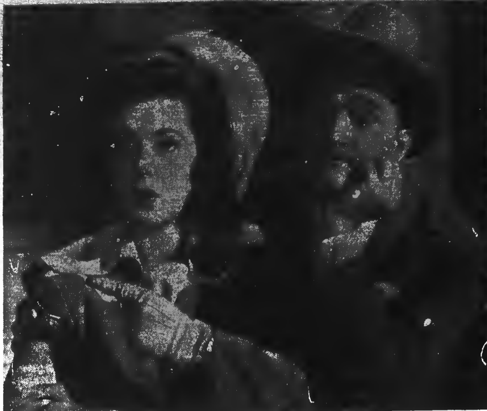
Red Skelton and Ann Rutherford are in love and in trouble in M-G-M's "Waisting in Brooklyn", riotous comedy scheduled to open Friday and Saturday at the Liberty Theatre. Pursued by a notorious gang, the two principals seem to be uncertain which way to go to escape a pack of gunmen. Ann thinks it should be to the left, while Red just thinks!