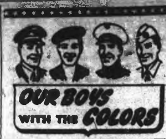
OUR BOYS WITH THE COLORS