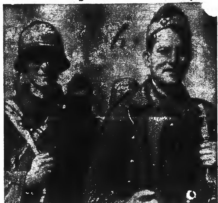
These two Nazi soldiers, captured from the lines near Carroceto, Italy, were also caught by the camera of an alert signal corps photographer. Completely unconcerned at being taken prisoners, the pair smile broadly for the cameraman. Or perhaps at their pleasure at having been captured.