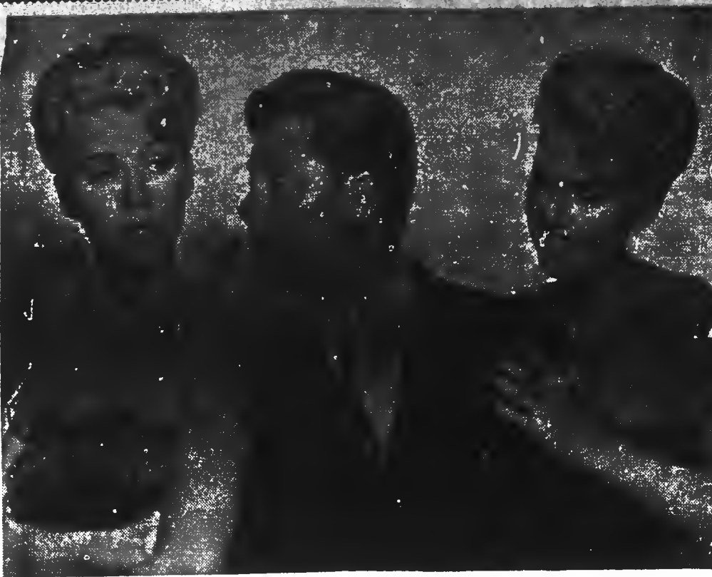
As Andy Hardy in M-G-M's film, "Andy Hardy's Blond Trouble", coming Thursday and Friday to the Liberty Theatre, Mickey Rooney has a problem on his hands trying to tell the Wilde Twins, Lyn and Lee, apart. But it's this problem that makes for a lot of fun in the latest of the Hardy Family series with all the old favorites and a few new ones, including Bonita Granville and Herbert Marshall.