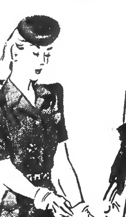
Figure-flattering, accessoryloving classics of kitten-soft wool-and-rayon jerseys and novelty weaves in lively tones. Etched with bright embroidery or felt appliques, softly tucked and shirred as fashion demands. 12-20.

Girls' Shoes $2.49 Saddle. Moccasin toe oxfords. Rut er-heeled slack shoes. Siles 31/2 to 10. Soft Glove Leather Step-Ins, Welt Constructed ...... $3.98