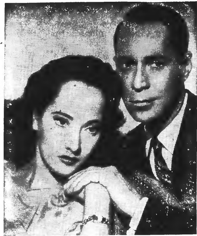
Hero and Heroine—Merle Oberon and Franchot Tone share both romantic and leading honors in Benedict Bogeaus' exciting picturization of the Saturday Evening Post serial "Dark Waters", now playing at the Liberty Theatre through United Artists release. Thomas Mitchell co-stars with Miss Oberon and Mr. Tone