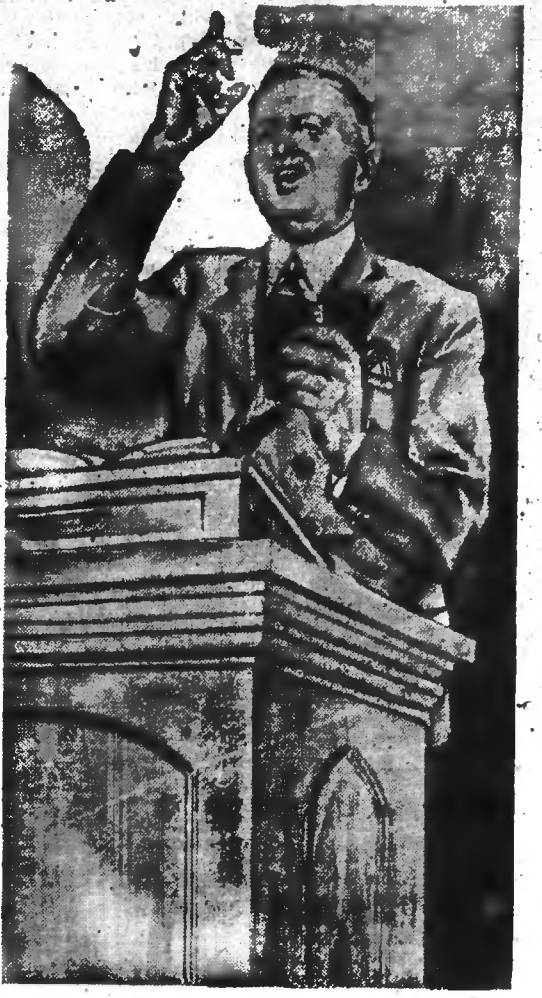
It pleased God by the foolishness of preaching to save them that believe.—1 Cor. 1:21

Necessity is laid upon me; yea, woe is unto me if I preach not the gospel.—1 Cor. 9:16