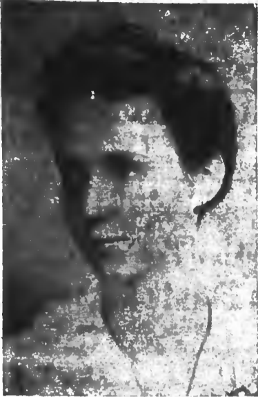
VI RJAMA HAMILTON