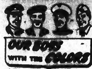
OUR BOYS WITH THE COLORS

It was said that only one of three shots reportedly discharged by the young man penetrated his body.