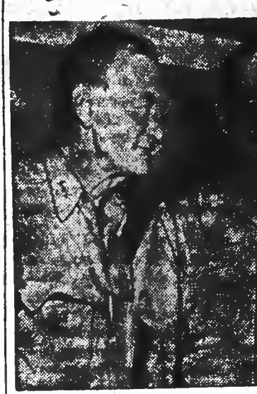
More than 1,000 airplanes of Admiral Halsey's (center) 3rd Fleet carrier force, which started sped up attacks against Tokyo and territory. Carrier Commander Vice Adm. John S. McCain (left) and Rear Adm. Gerald Bogan (right) were responsible and figure prominently in the latest devastation of Japan. They are shown aboard ship somewhere in the Pacific.