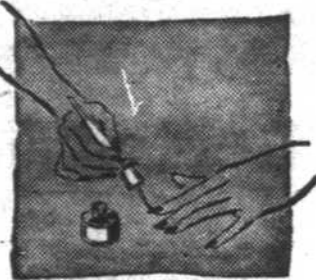
Left or right hand—makes no difference! You're an expert, with the Lucite plume!

A brand new life in wear! A brand new life in application!