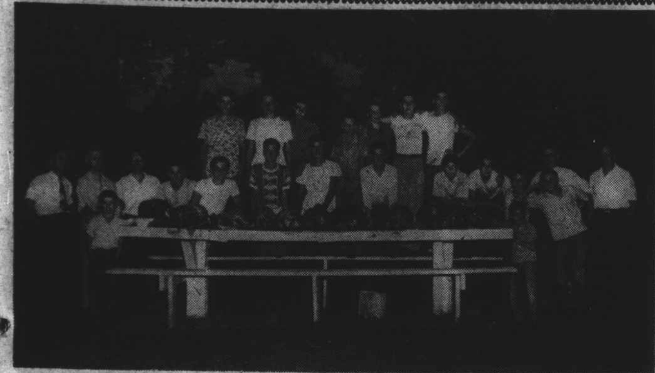
This photo shows the Junior Optimists Club enjoying a watermelon feast Friday evening at Smoot Park. With the boys were a number of members of the Senior Optimist club, which has as its principal activity, work among the boys of the community. Already two baseball teams have been formed through work of the newly formed Optimist club and boys are enthusiastic in their response to organization efforts.