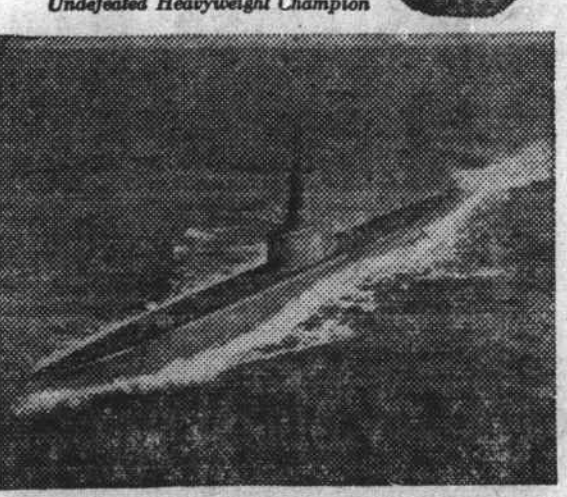
Navy's new submarine travels underwater faster than submarines ever did on top. They now can cruise submerged for days.