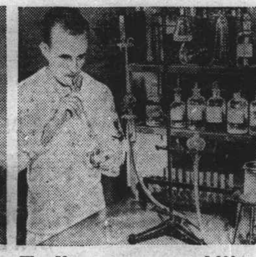
A guided missile is launched-Navy co- The Navy sponsors over 1,200 research projects at 200 university, government and industrial laboratories.