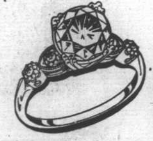
Exceptionally fine diamond in unique ring. $295