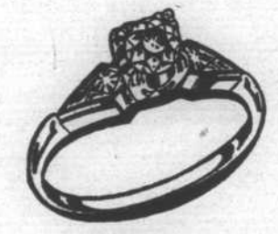
Modern engagement ring, modestly priced. $50