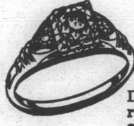
Diamond ring in 14K gold setting. Lovely. $100