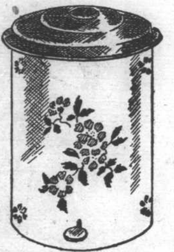
Gleaming White Metal STEP-ON CAN

WE PREDICT A SELL-OUT—SO BE HERE EARLY WEDNESDAY Every Piece Is Worth Twice This Low Price.