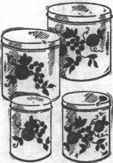
Lithographed Design CANNISTER SET

PENNEY'S SCORES for WEDNESDAY Give Your Kitchen The New Look For Spring