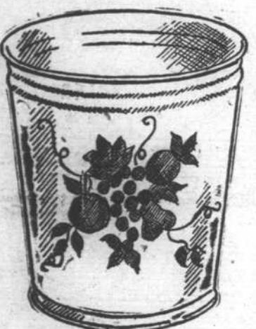
Large Size Lithographed KITCHEN BASKET