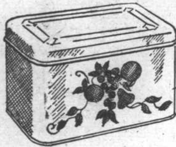
White Enamel Finished BREAD BOX