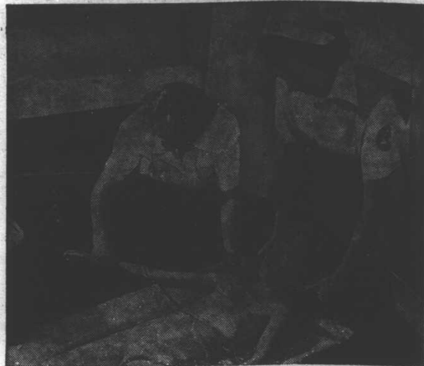
Red Cross volunteer nurse's aides take special training to qualify them to assist physiotherapists in polio treatment. Last year these workers served in 674 hospitals and other agencies.