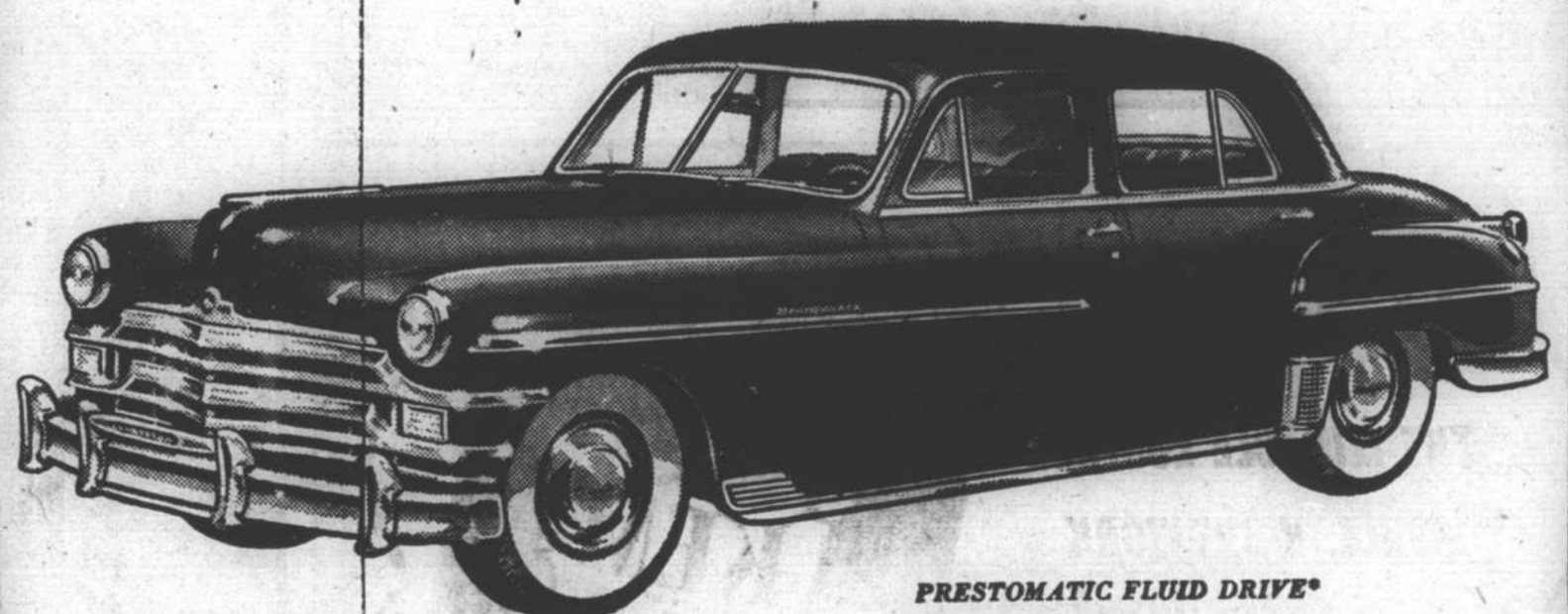
PRESTOMATIC FLUID DRIVE TRANSMISSION

The Beautiful Chrysler Silver Anniversary Model