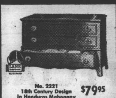
No. 2221 18th Century Design in Honduras Mahogany $7995

Say, "I love you, Mother," with this most beautiful, most practical gift of all! Also the perfect gift for weddings, engagements, graduations, anniversaries. Come in now for remarkable values! Guaranteed against moth damage.