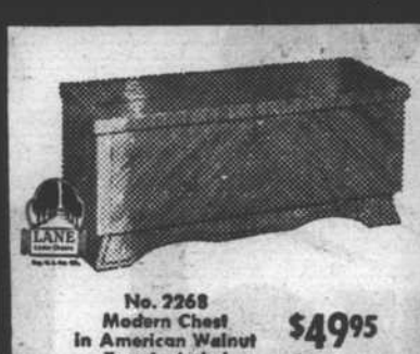
No. 2268 Modern Chest in American Walnut Tray Included $4995