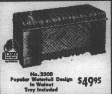
No. 2200 Popular Wonderful Design in Walnut Tray Included $4995

AS ADVERTISED IN LIFE THE Real Love-Gift FOR MOTHER'S DAY MAY 8th