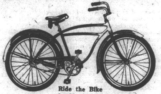
Ride the Bike the Movie Stars Ride