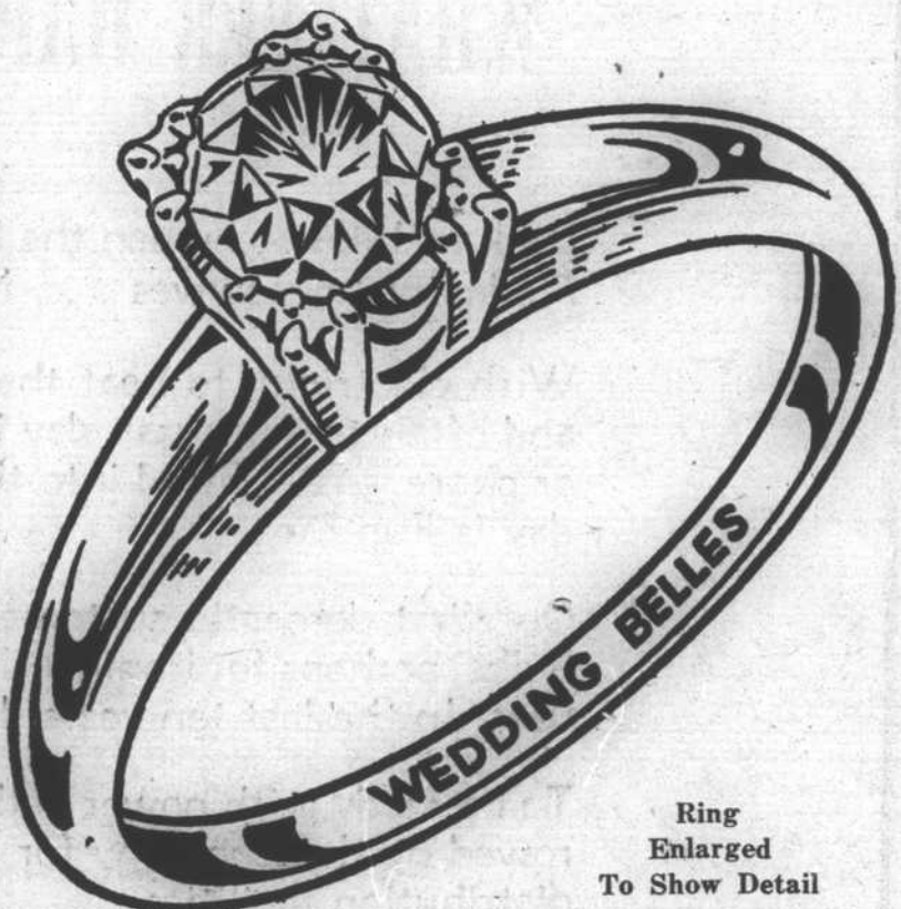
Ring Enlarged To Show Detail

ONLY AT THE JEWEL BOX LOOK AT THIS EXCITING LOW PRICE! Flawless Diamond IN RICH 14K GOLD