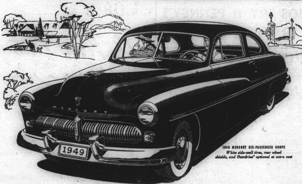
1949 MERCURY SIX-PASSENGER COUPE White side-oval tires, rear wheel shields, and Overdrive optional at extra cost

Tune In Every Day At 1:00 P. M. and 5:05 P. M. to Station WKBC