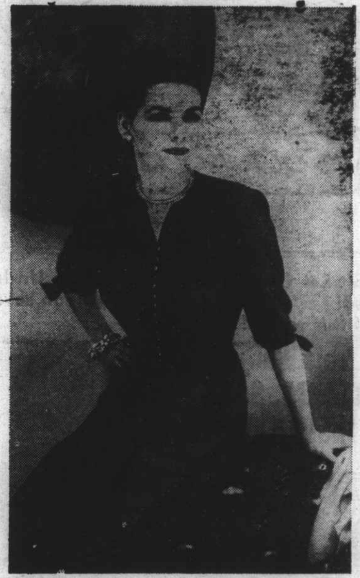
DRAPED BODICE DRESS —Convenient step-in with concealed slide fastener in skirt. Tie-tub sleeves. Green, copper, autumn navy, black rayon crepe. 14-44. Also, 14½-22½. 8.95