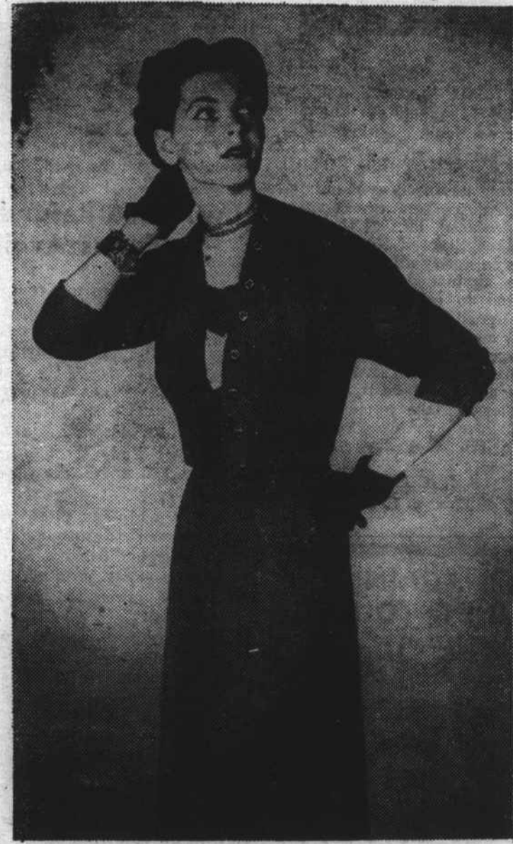
WORSTED JERSEY CARDIGAN SUIT —In pet woolen! Cropped cardigan over dress that lights face, teal with seafoam green. Or mauve with pink. Stone blue with azure. Coffee with cream. 10-20. 19.95