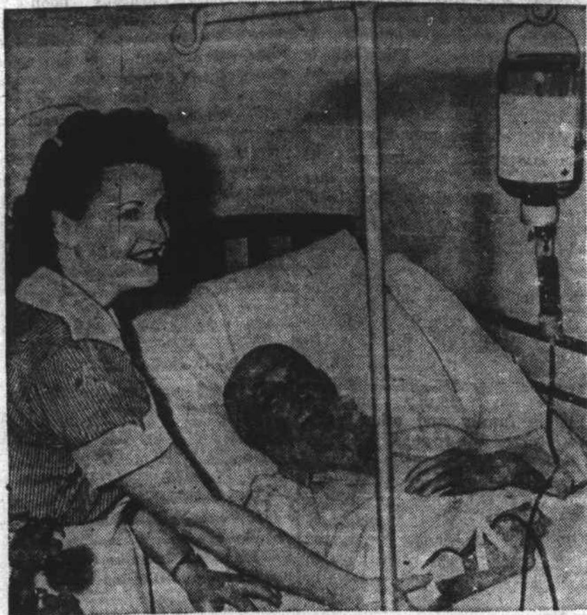
BOISE, IDAHO—A patient at St. Luke's hospital here receives a transfusion of blood collected during the first week of operation of Boise's 16-county American Red Cross regional blood center—the 22nd such center opened in the new Red Cross national blood program.