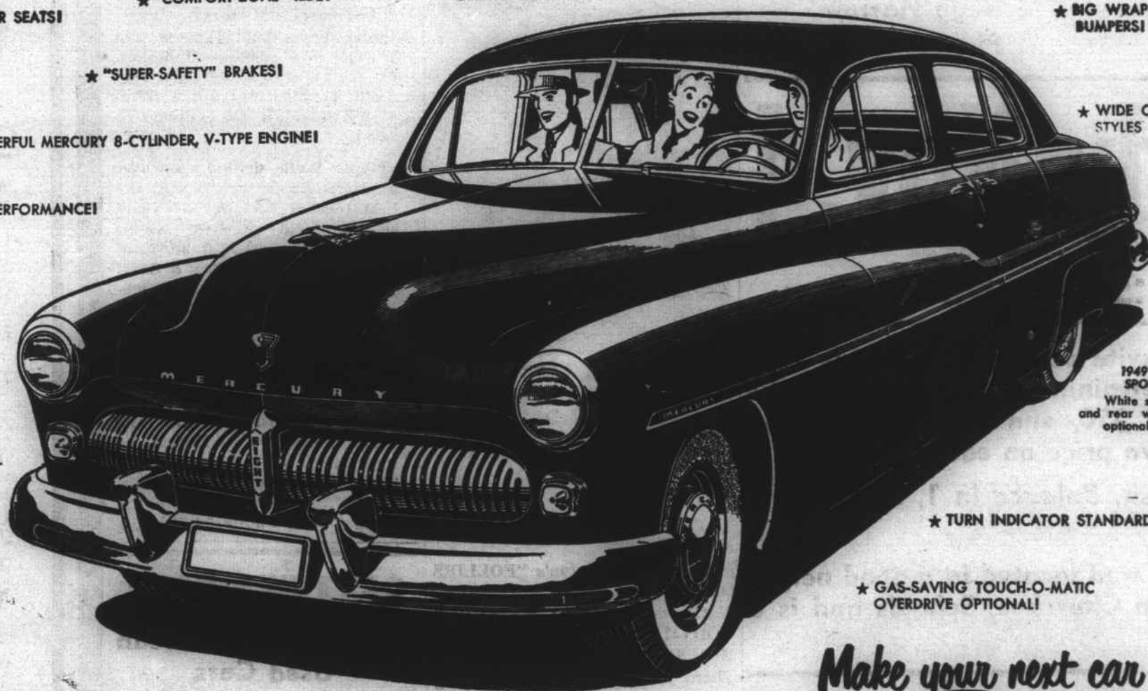
1949 MERCURY SPORT SEDAN White side-wall tires and rear wheel shields an optional at extra cost.

WHY are so many thousands more people driving Mercury today? Because at today's new car prices, the big, new Mercury is a better investment! It's not only the smartest-looking car on the road today, it's actually one of the