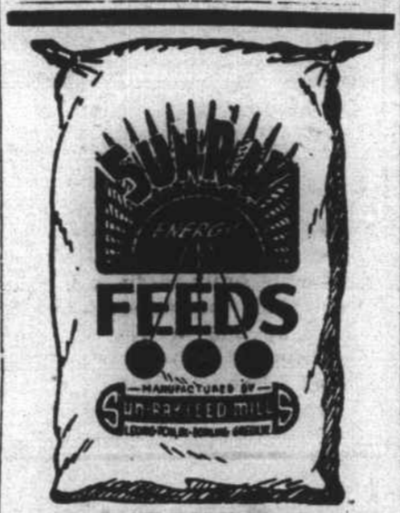
LIN BUMGARNER 3 Miles West on Highway 421 Phone 26-F-21, North Wilkesboro

Here at your store we have secured large supplies of seasonable goods for your winter comforts. They come direct from the manufacturer. — The Goodwill Store. 11-14-21