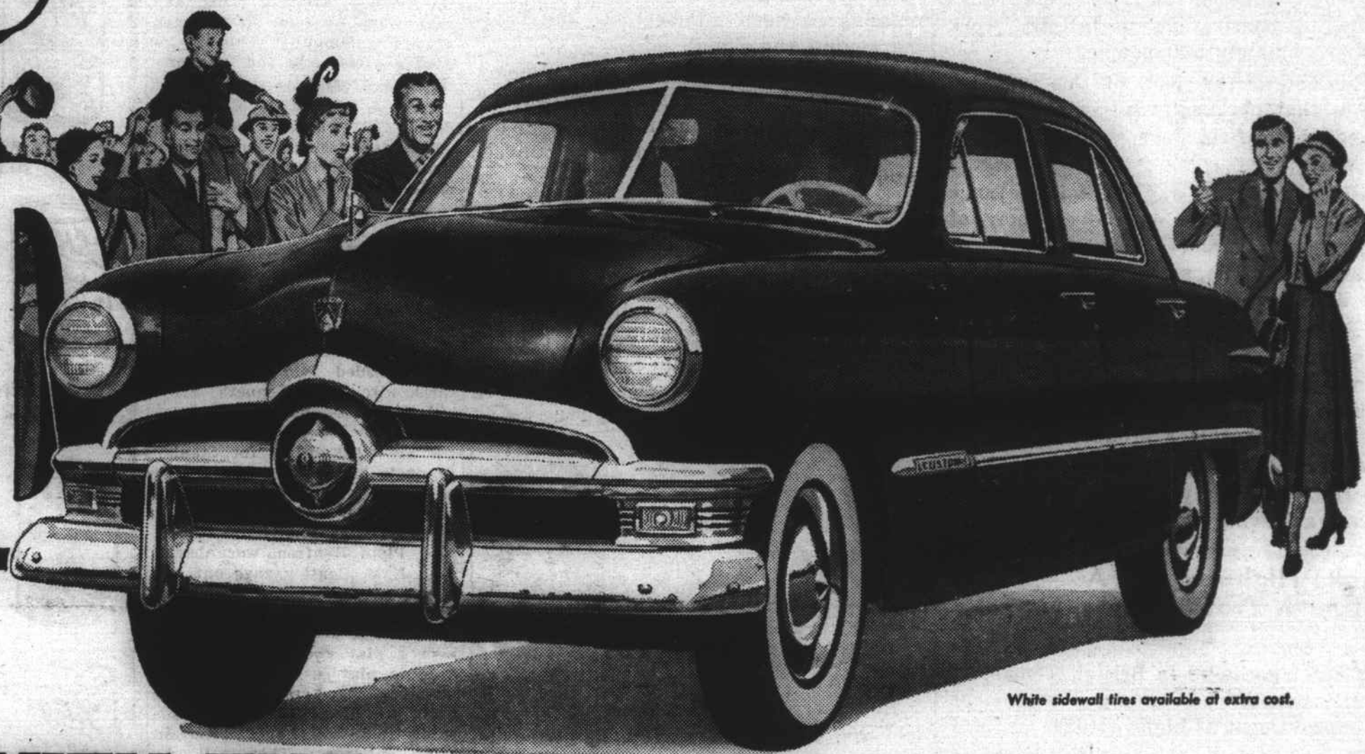
White sidewall tires available at extra cost.