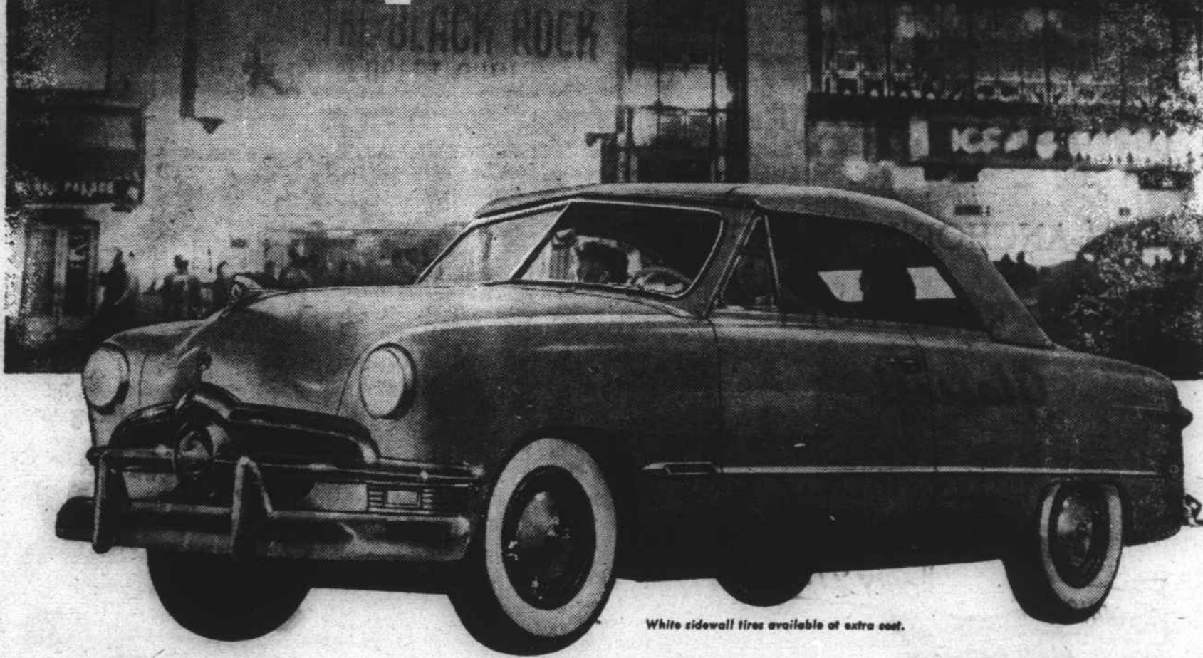
White sidewall tires available at extra cost.