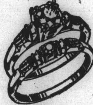
Matched Set $13750