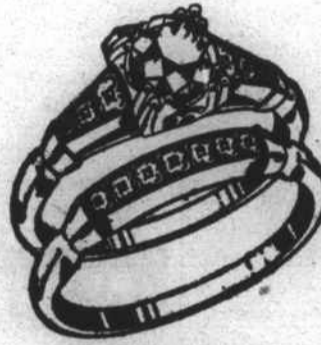
Bridal Ensemble $8900