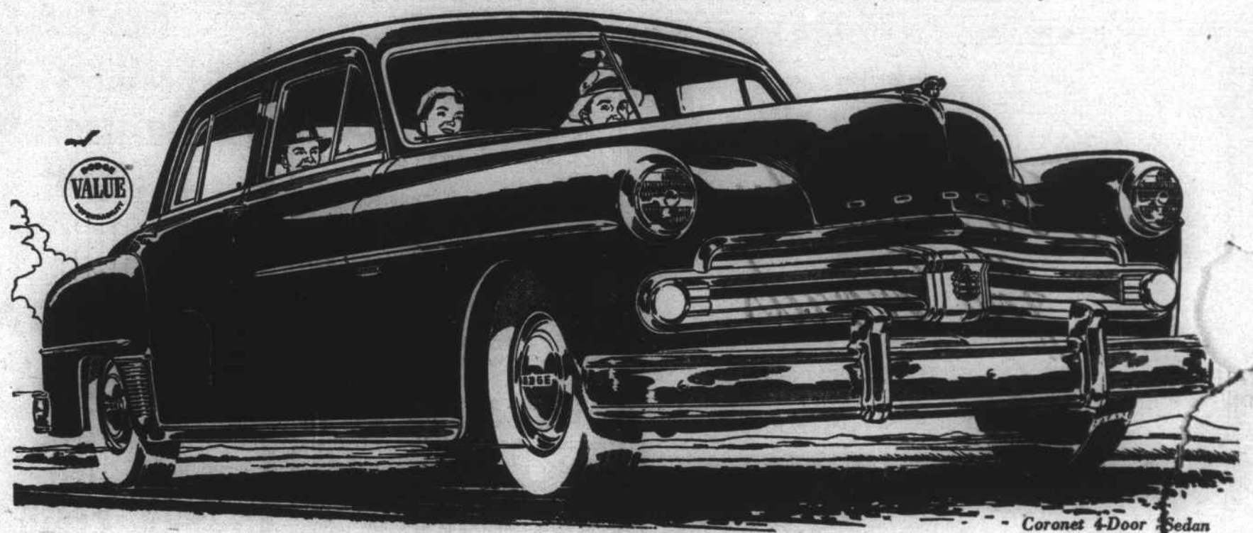
Coronet 4-Door Sedan

and still not get all the beauty . . . extra roominess . . . famous ruggedness of this great new Dodge!