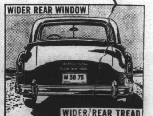
BIGGER VALUE! New rear "picture window" for safer driving vision. Wider rear tread means greater safety, better road stability, more riding comfort.