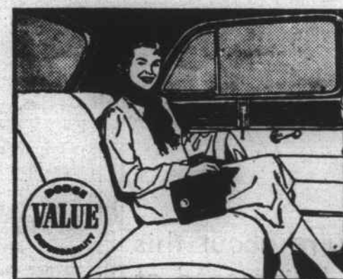
BIGGER VALUE! Dodge interiors measure up to extra comfort . . . give you more head, elbow and leg room so you can sit naturally in a relaxed position.

And here's BIGGER VALUE in performance. You get the flashing pick-up of the big high-compression Dodge "Get-away" Engine . . . the amazing smoothness of gyrol Fluid Drive. Ask us for a "Magic Mile" demonstration ride. Come in, see and drive the new Dodge today.