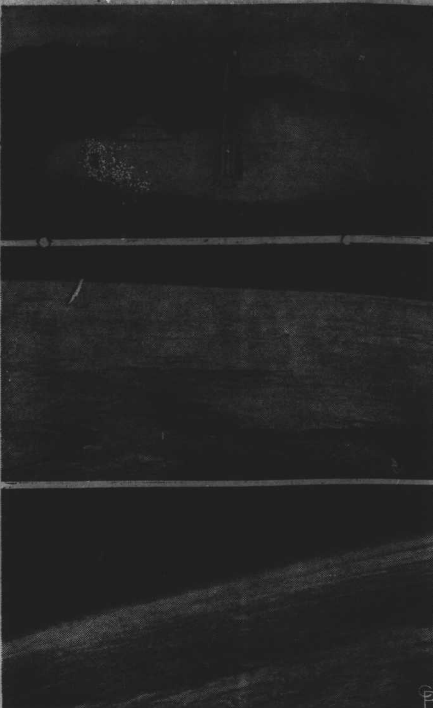
HURTLING SKYWARD after being launched at the White Sands Proving Ground, New Mexico, a V-2 rocket (top), installed with a special camera, begins its speedy trek into the heavens. Reaching a maximum velocity of 2,985 miles per hour, the camera-carrying rocket photographs the earth (center) from a height of 30 miles. In the air slightly more than three minutes, the rocket (bottom) gives the camera a "lens-eye" view of the earth from an altitude of approximately 75 miles. Note the earth's curvature. (News of the Day Newsreel Photos from International)

14-week series will tell the story of a community within range of the radio voice of the Journal-Sentinel Station.