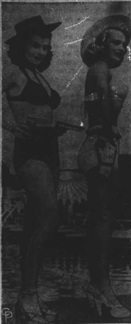
WHEN IT COMES to being quick on the draw—box office that is—Corrine Calvet (left) and Marie Wilson are experts at the game. On location at Las Vegas, Nev., the gals will have a tough time keeping a leading man if they insist on being "trigger happy."