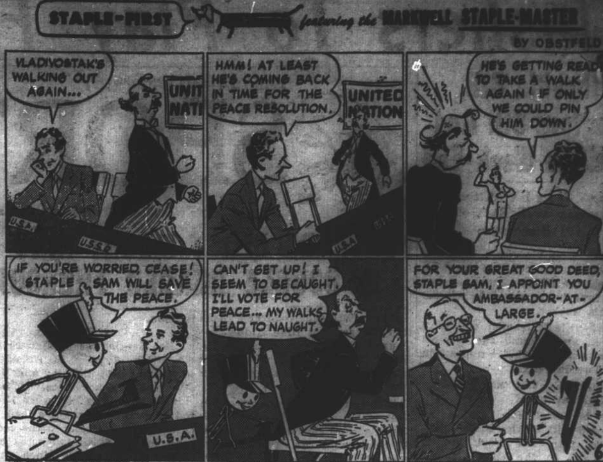
IT'S "BOUND TO HOLD" WITH MARKWELL