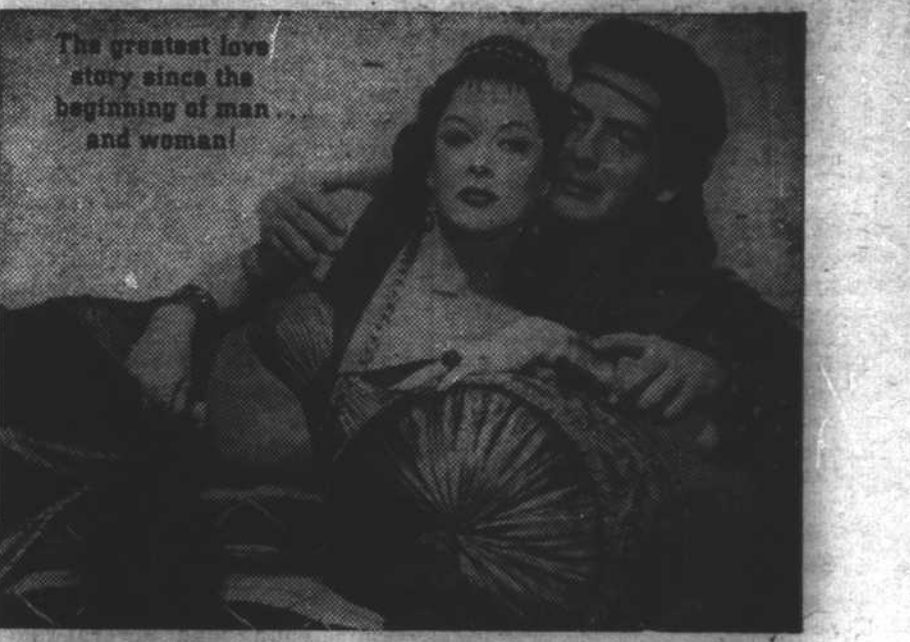
SEE Samson, blinded and chained to the grist mill, tormented by his enemies! SEE Samson, challenged, hurl to the earth the giant of all the Philistines! SEE Delilah learn the secret of Samson's strength... and betray him! SEE Samson, armed with the jawbone of an ass, defeat a host of Philistine soldiers!