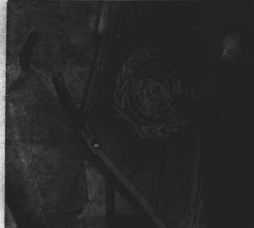
AFTER THE UNITED NATIONS Security Council authorized the use of the U.N. flag in Korea, Secretary General Trygve Lie (right) hands over the banner at Lake Success, N. Y., to Warren R. Austin, chief United States delegate. Banner will fly alongside those of U. S. and other countries that have pooled their forces against the North Korean Reds.