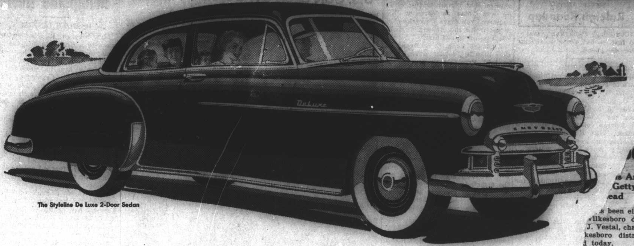
The Styleline De Luxe 2-Door Sedan

Virginia apple growers are looking forward to one of the full crops in recent years with 11,400,000 bushels estimated, a million bushels higher than in June. The U. S. D. A. estimate for North Carolina is 980,000 bushels of apples or just about the same as the crop in 1948.