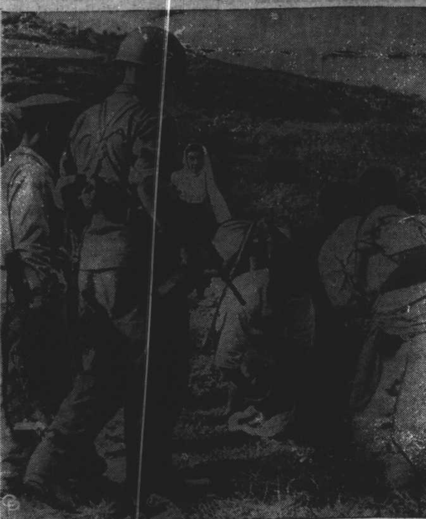
INSPECTION SCENES like this are staged everywhere in South Korea by heavily armed GI's and Korean soldiers as hordes of innocent appearing civilians cross U. S. lines. Every civilian and his bundle represents a potential Red Fifth Columnist and death to an American soldier, hence the most careful search is imperative.