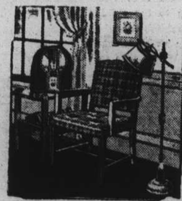
New 1937 4-Piece