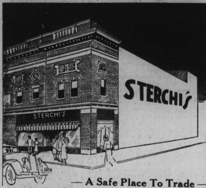
—A Safe Place To Trade—

AUTOMOBILES BOUGHT—SOLD AND FINANCED BY Rogers Motors