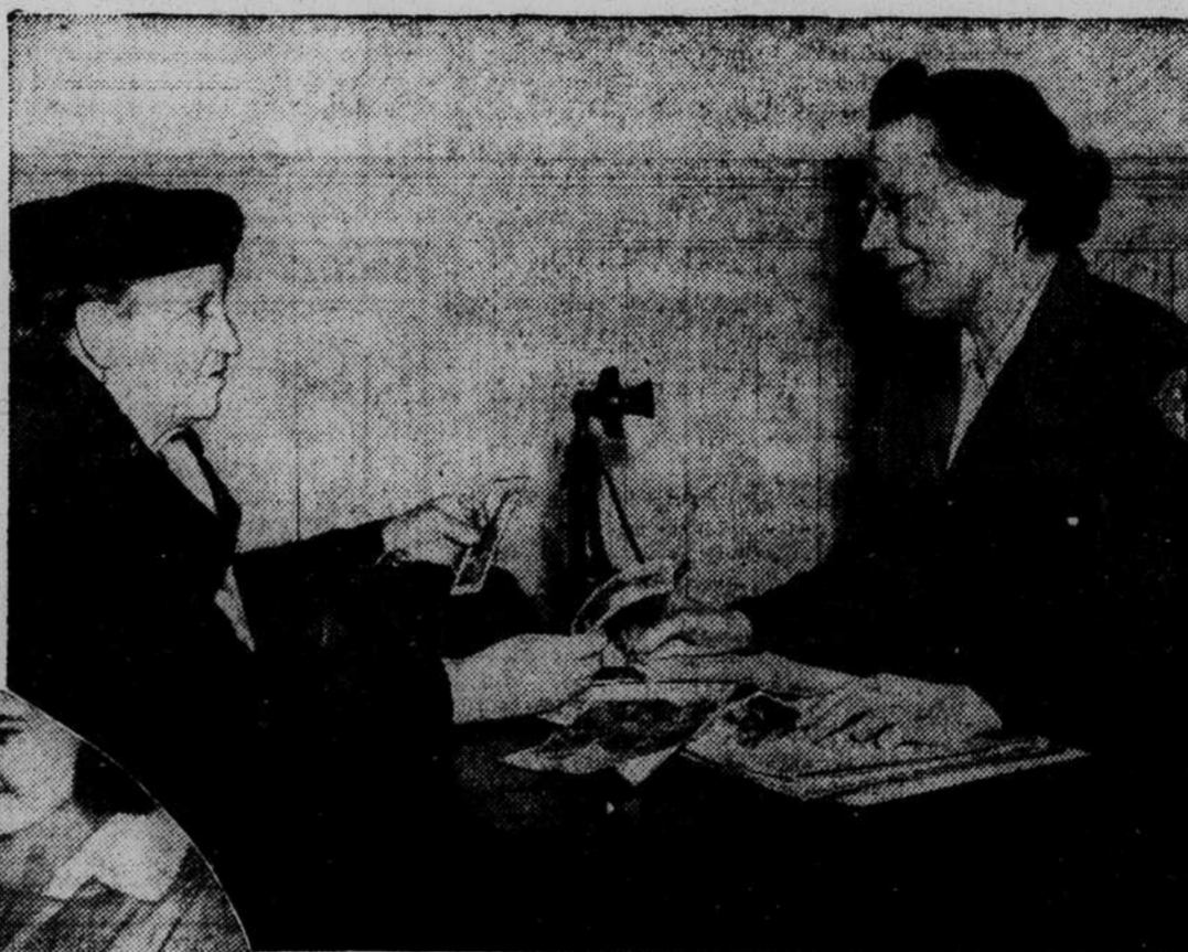
WHEN LETTERS STOP , G.I. Joe's family turns to the Red Cross for help and advice. And the Red Cross sets in motion its worldwide organization to locate Joe and find out what's up!

But in this war, all are affected. And the Red Cross reaches out to aid all —in many and varied ways. Below a few typical scenes show the Red Cross in action on the Home Front!