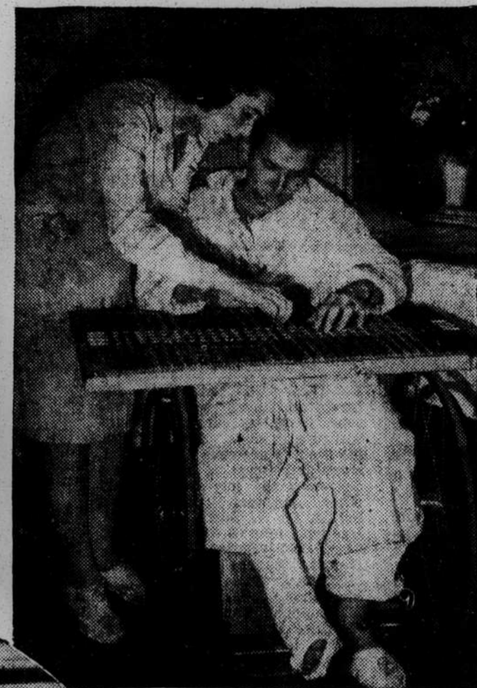
WHEN JOE RETURNS—WOUNDED! Red Cross Recreation and Hospital Workers brighten long, dreary hospital hours—relieve the worries that spring up in sick men's minds. And when Joe and his family meet again, both have been prepared by talks with Red Cross workers.