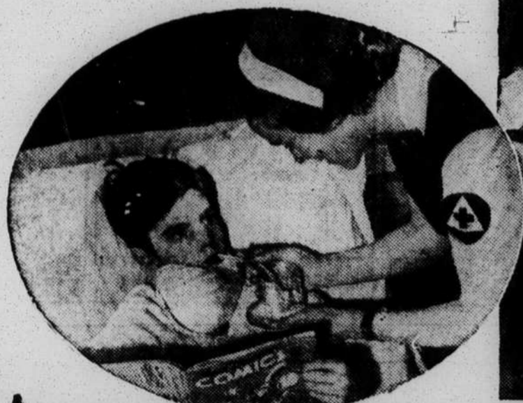
THE NURSE SHORTAGE is being relieved in civilian hospitals everywhere by Red Cross recruited-and-trained Nurse's Aides. The Red Cross also recruits and trains Dietitian's Aides—a very important part of hospital work.