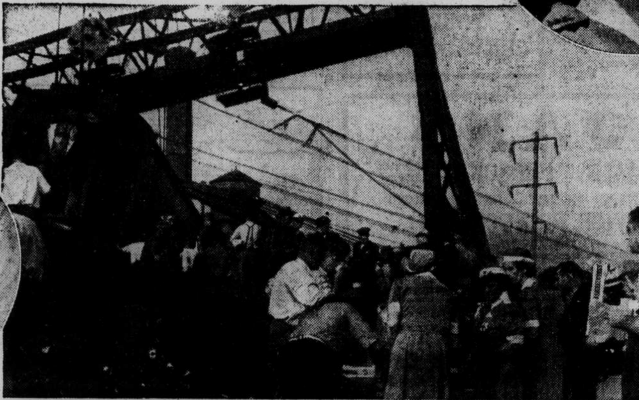
DOMESTIC DISASTERS INCREASE IN WARTIME! During the past fiscal year, there were 257 disasters in the United States—more than ever recorded for any single year. And the Red Cross was on the scene for all of them! Victims were fed, clothed and sheltered by the Red Cross! And that's not all. The Red Cross also works with local agencies in the long-term job of rebuilding homes and providing medical care for the injured.